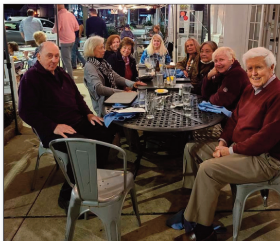
Club members enjoyed a Monday night dinner at The Beach House in Old Greenwich.