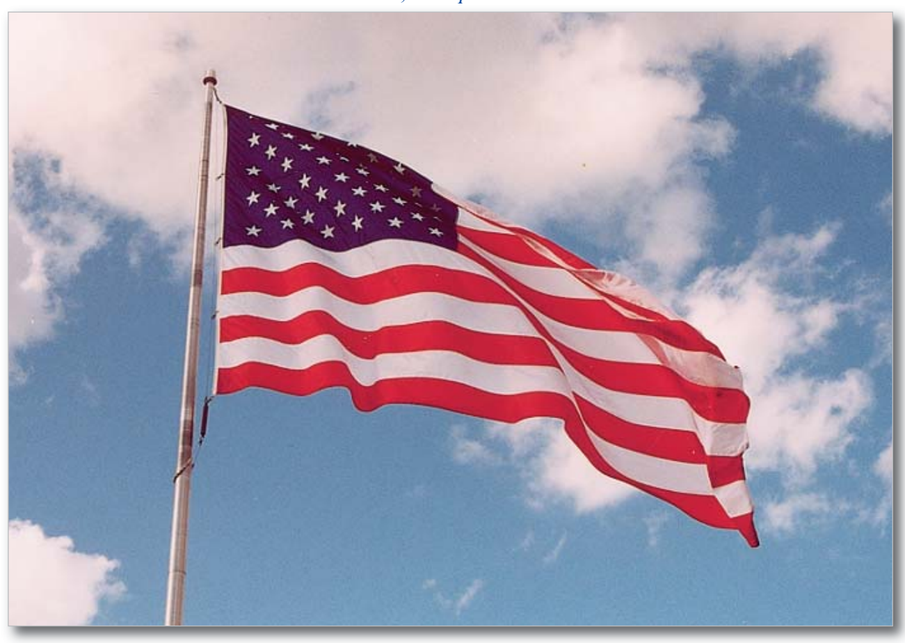
Copy and paste this URL into your browser and then press 'enter' to hear "America the Beautiful". https://www.youtube.com/watch?v=Rzs52OzgWOs

America "O beautiful, for spacious skies...."