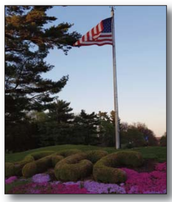
Sterling Farms Golf Course, Stamford, CT