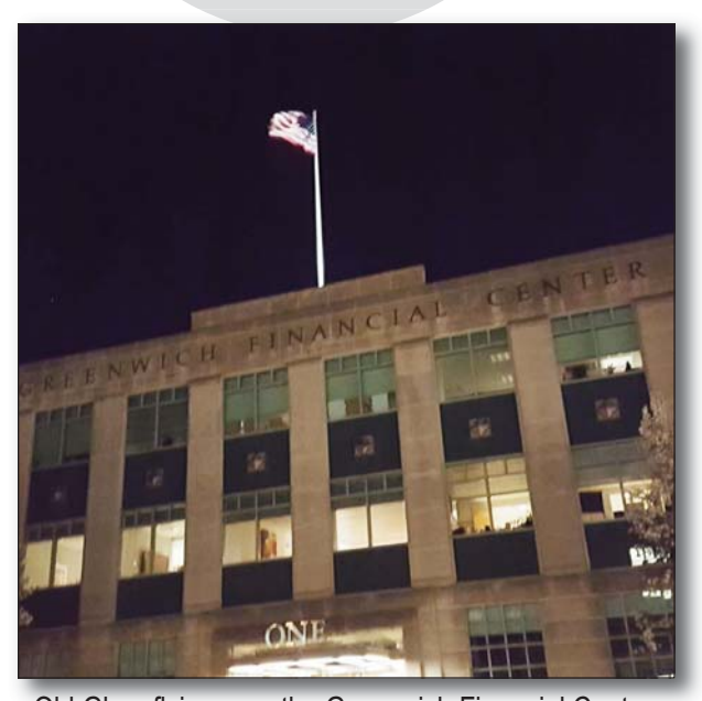
Old Glory flying over the Greenwich Financial Center

There is currently no book group meeting scheduled for May. If a meeting is announced, members will be notifed at a later date.