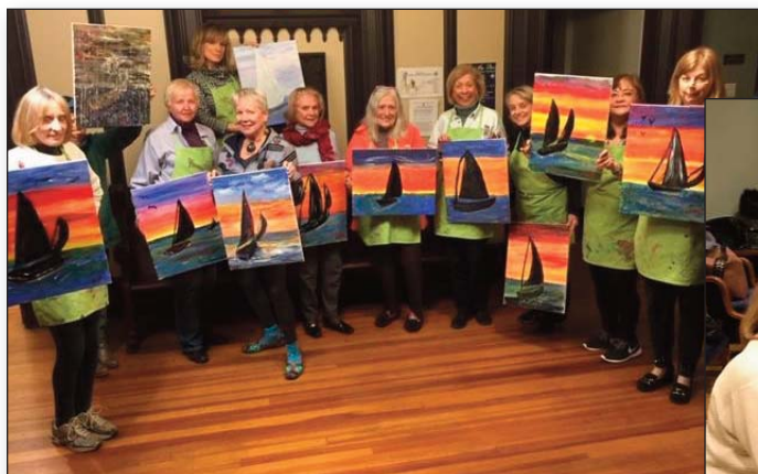
All enjoyed Paint Nite!