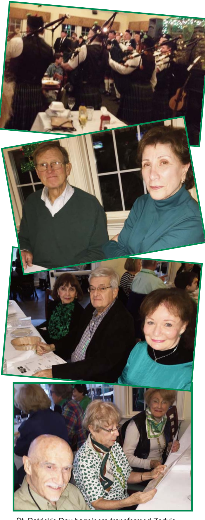
St. Patrick's Day bagpipers transformed Zody's into a little bit of Ireland. Cheers and beers!