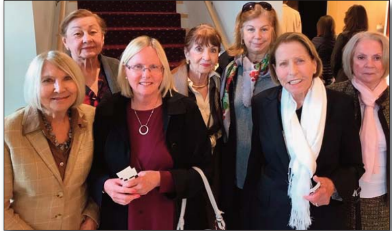
Greenwich Club members had a great time watching the play Mamma Mia at Curtain Call in Stamford.

Membership renewal will begin in November and run through January 31st. You will receive a membership form to be completed by you and returned with your $45 check.